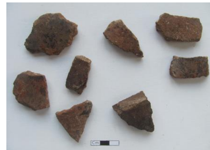
Fig.2: Sherds from 103

Trench 1 (T1) was sited to section the assumed outer enclosure ditch (120) and once the residual medieval soil (101) was cleaned back the edges of the ditch became more evident. The next context (102) produced no finds, but sealed by this was an alluvial silty layer (103) and the sherds we had been hoping for (8 no less). We await confirmation but initial analysis suggests they are Iron Age (Fig.2). If so this is the first proof of the assumed date range of the Dykes. A bulk sample of this layer was taken for processing.