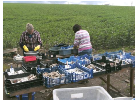
Sorting pipe fragments at Little Potheridge