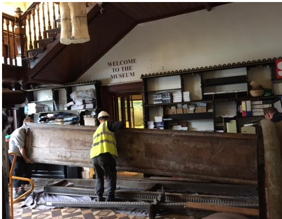
Introducing the table to its new home.

So why is it so important? The Landkey Table is a rare example of a type of table found in institutions such as colleges, monasteries and almshouses. The earliest long tables were boards placed loosely on trestles and the seats were long benches or, in higher status contexts, individual stools. By the seventeenth century joined refectory tables were adopted in large houses. The Landkey Table is an intermediate type which still has trestles but where the top is fixed and where the benches are attached to the horizontal trestle supports. This emerged in the sixteenth century in institutional contexts. The fixed benches are a very rare feature. It is one of only two parish room tables from the 16th or 17th century known in Devon and is an exceptional example of the workmanship of West Country craftsmen. The table, which was probably assembled inside the parish house, measures almost 17 feet long and is made from a single plank of oak, with benches on either side, one trestle-end carved with the date 1655 flanked by the churchwardens' initials WL and TG (William Lavercombe and Thomas Gould were churchwardens in 1655). This appears to record a repair.