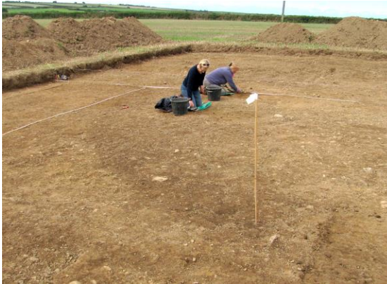
Fig.4: Cleaning back with ring ditch visible (206)

So despite limited time on site and with limited personnel, results have been encouraging. Other Iron Age sites in the area have yielded very little in the way of pottery and to find 8 sherds in just one section of the ditch is significant and points to the importance of this site. The alleged find of a blue glass bead by a previous farm tenant (Fox 1996) also hints at high status.