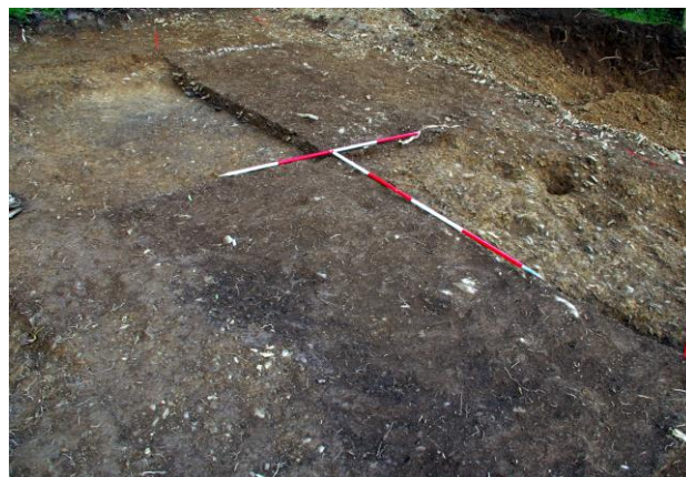
Rectangular hollow of the west building

Monitoring work undertaken by SWARCH in advance of the construction of a horse menage at Charles, Brayford, revealed the remains of two small medieval buildings. They were uncovered behind Deerpark Farm in the corner of a field listed on the tithe apportionment as 'garden', next to 'Leworthys' field, and about 80m south-west of a site we monitored in 2012 that produced medieval coarseware pottery from several slight ditches. The two structures were represented by rectangular hollows roughly 7x4m across cut up to 0.4m into the natural. The eastern building produced no clear structural evidence or artefacts. The western