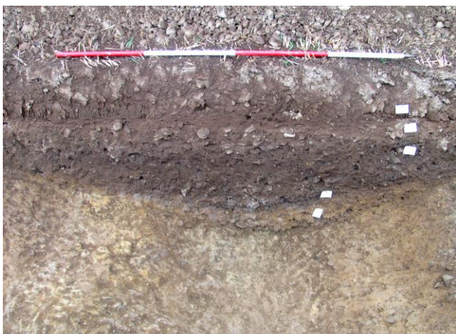
Fig.3: Section of outer enclosure ditch (120)

Beneath this was a shallow layer of loose subsoil which had slipped back into the ditch soon after construction (104). The depth of the ditch was a maximum of 1.4m (Fig.3) and this suggests that if the Dykes is a 'developed hillfort' (Cunliffe 2004) then the outer enclosure had a less defensive aspect and that it possibly related more to stock-keeping (the inner enclosure ditches of the scheduled monument appear to be both wider and much deeper).