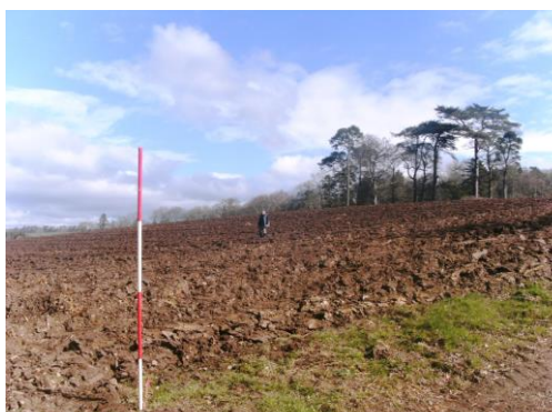
Flint field at Huish with lone fieldwalker

with geology research. We undertook a gridded fieldwalk in part of the field in 2016 to look for raw material but were unsuccessful.