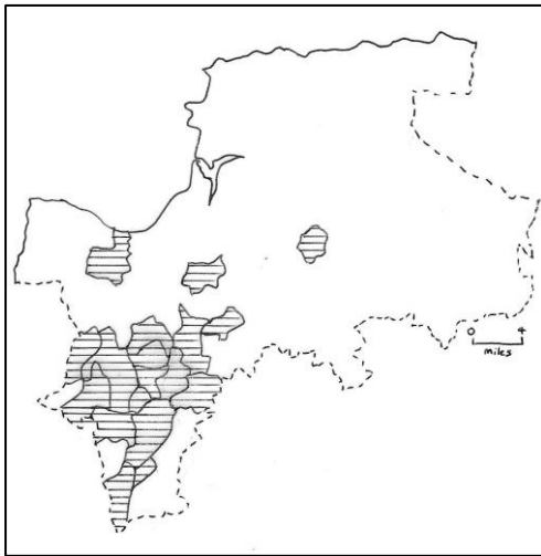
Sketch map showing parishes with an agistment holding (shaded). Study area boundary shown with dotted line.

quantify the number or area of such holdings. It is highly likely that the practice of agistment went into decline over a period of many years and perhaps land previously used as agistment was incorporated into neighbouring holdings.