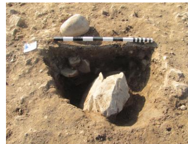
Fig.5: Post-hole (208)

All the bulk samples were processed in the flotation tank and have been handed on to South West Archaeology for further selection and analysis. It is hoped that dating material can be obtained which will clarify the relationship between the enclosure ditch and the ring ditch.